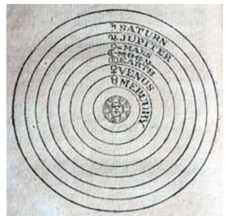
The generally accepted arrangement of the planets, but rejected by Leach